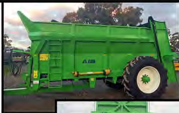
VB1400 with 300mm extension sides