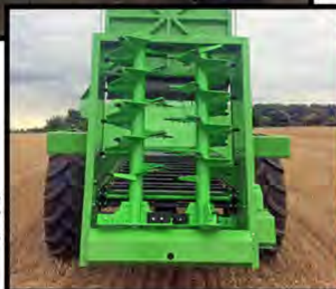
Stepped auger flights and 2 x 20mm floor chains