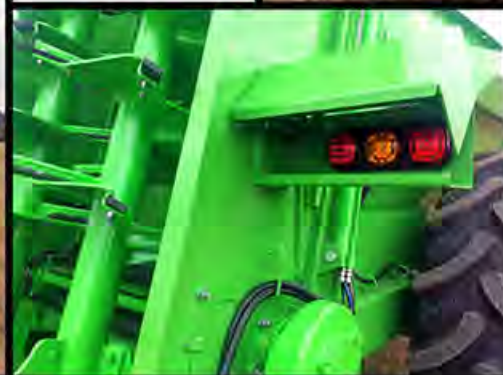
LED road lights c/w auto covers